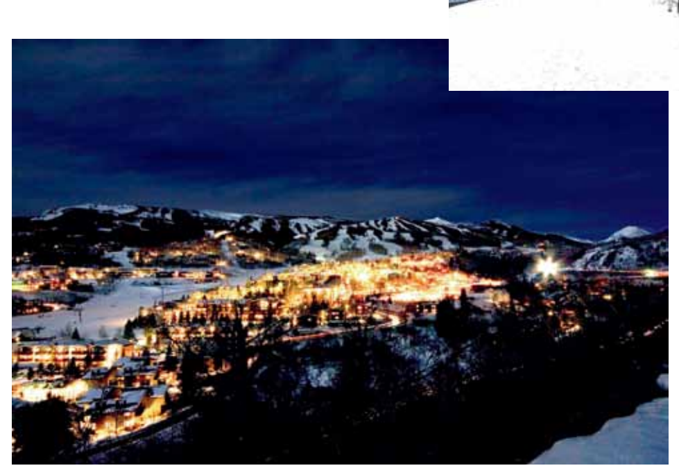
Clockwise from top The Aspen streetscape is hard to beat. Get to the best snow available on a snowcat tour. The Cliffhouse Cafe on top of Buttermilk Mountain is great for a mid ski lunch break with views. That's what you're after, backcountry bliss skiing. The nightlife is equally famous as the snow in Aspen. More European than Zermatt, the beautiful streetscape of Aspen.